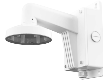
LTB342-140B Wall Mount with Junction Box