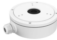
LTB701/LTB701B Junction Box