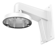
LTB342-140 Wall Mount Bracket